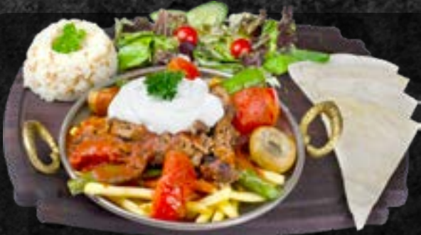
Çeltik kebabı 25,95 Traditional skewer of tender lamb, kofte, fries, yoghurt and special spices.