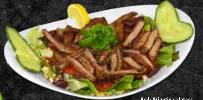
Acılı Arjantin salatası