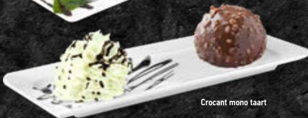
Crocant mono taart