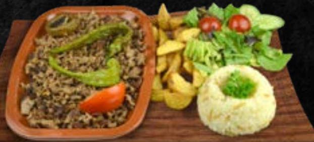
Shoarma schotel 19,50 Finely chopped lamb.