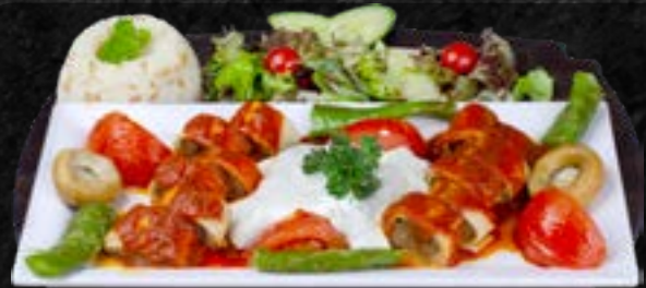
Beyti kebab 23,95 Seasoned kebab rolled up in wrap topped with Turkish yoghurt and tomato sauce.