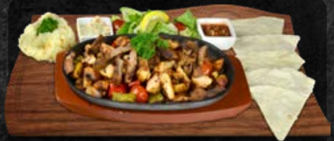
Fajita 28,50 Mexican style spiced pieces of lamb cutlet and chicken fillet with red pepper, green pepper, onions, mushrooms and soy sauce