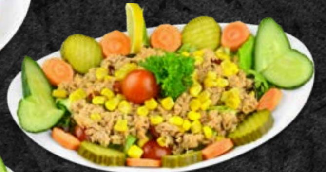
Ton balığı salatası