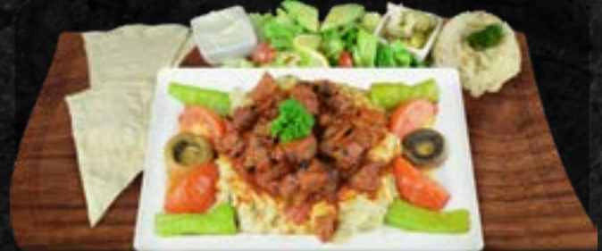
Beğendi kebabı 25,95 Traditional steak on special marinated eggplant, Dutch cheese and cream sauce.