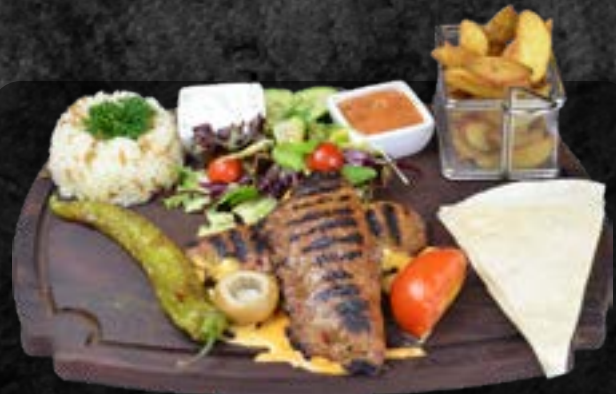
Keyf kebabı 25,95 Double folded seasoned minced meat with cheese. Prepared on the grill.