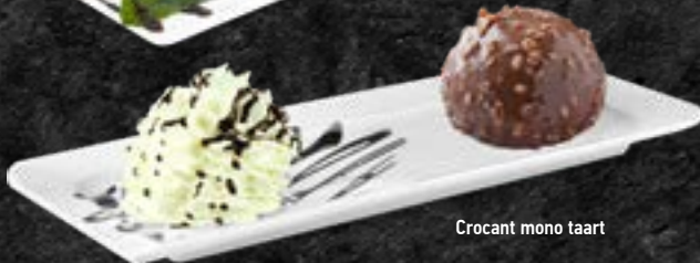
Crocant mono taart